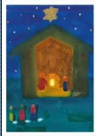
The Manger by an unknown artist from Botton Village

The greeting inside both of these cards is "Peace at Christmas"