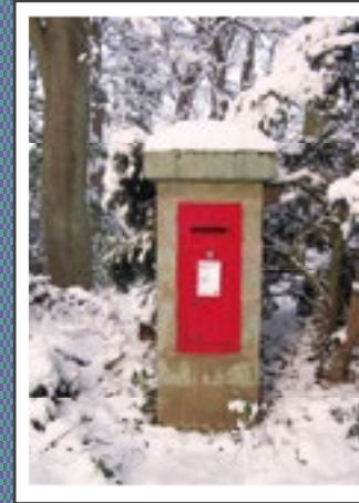
Botton Post Box by Jackie from Botton Village