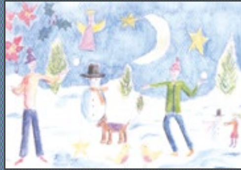
Snowball Fight by Melanie from our St Albans community