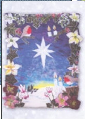
Christmas Collage a collaborative piece by the Craft Studio at our Larchfield community

Please note: greeting inside sits high in this card